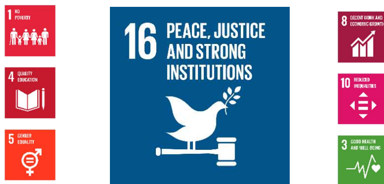
Graph 1: SDGs relevant to the KoGe Programme 2021-2024

SDG 16+ states that Sustainable Development Goal 16 must not be considered in isolation from the other SDGs. The "plus" therefore emphasises the link between SDG 16 and other SDGs.